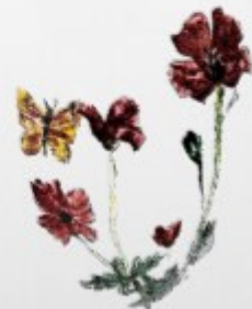
Article & Photos Contributed by: LaWanda Calhoun