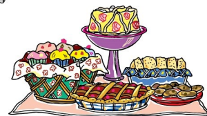
FSECC Bake Off

All you will need to do to enter to participate in these events is make your on-line pledge and bring a printed copy of your confirmation to any staff in Human Resources. We will mark your name on a list and you will be able to participate in all events.